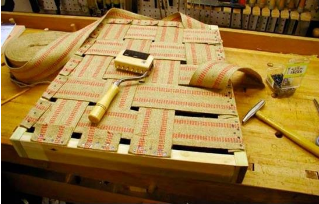
Picture 4.2: Preparation of colon upholstery floor on furniture frame