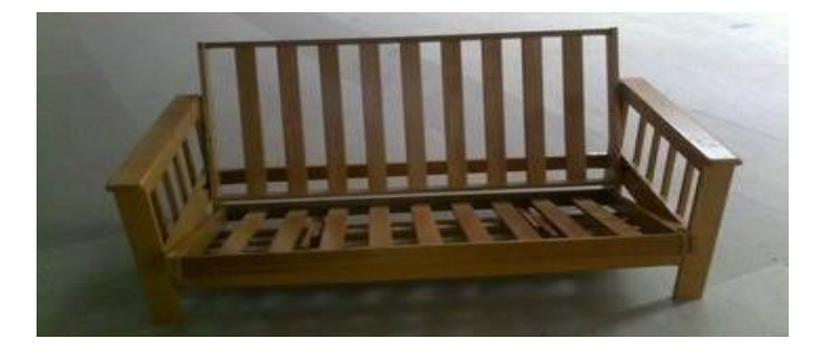
Picture 3.7: Seating and back furniture frames proper with general frame