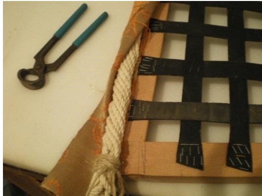
Picture 3.5: Measuring furniture frame and Furniture frame hammered rubbered colon