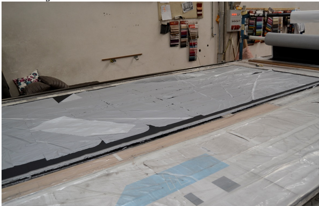
Figure 1.6: Cut-off plan on an automatic fabric cutting machine