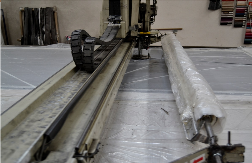
Photo 1.5: Cloth Spreading(Pastal) cutting on automatic fabric cutting machine