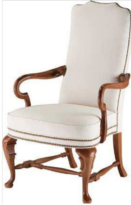
Picture 6.22: Sample of upholstery placed face cloth and cleared from extras

The lines are used to hide extra parts and provide good image and attached with hot silicon and hobnail.