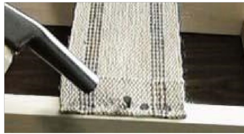
Picture6.7: Binding colons to furniture frame

The colons prepared to the proper measurement are monrtaged. Colons should be placed balanced . The distance of two colons shouldn't be more than 5 cm . Colons can be fixed spirial arched upholstery in accordance to technic of it. Firstly colons are stapled and nailed from the upper part of furniture frame by folding .