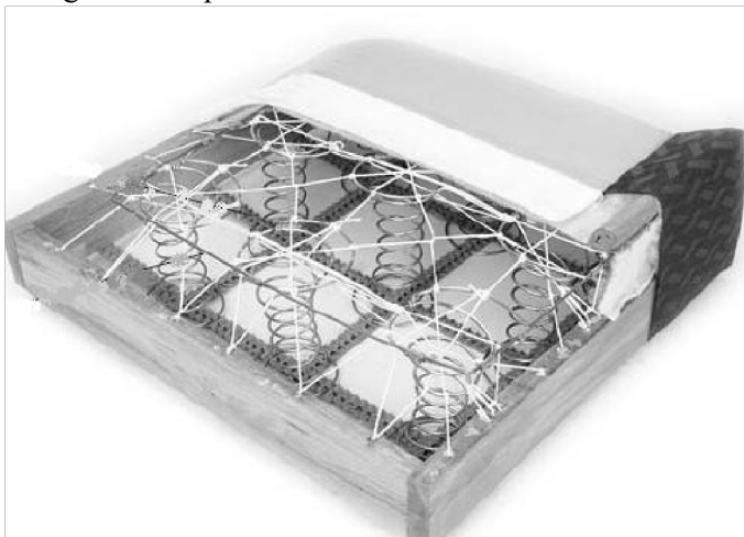
Picture 6.10: Upholstery surface of spirial arch binded furniture frame

Colons are fixed under the furniture frame. After the adjustment spirial arches is worn by stretching lining cloth or quilted.