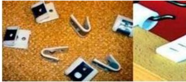
Picture 5.9: Zigzag arch hinge

Arches cut proper to upholstery floor is attached to stable or portable furniture frame prepared before with the aid of lock hook.