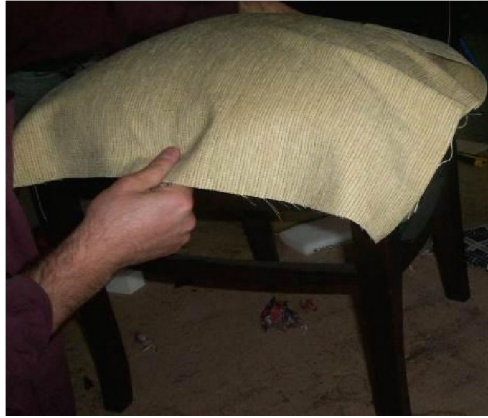
Picture 5.20 Preparation of lining cloth