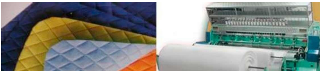
Picture 4.15: Kapitone makinesi ve yapılmış işler

Technology which is improving fast regresses applications which is not suitable for serial manufactory and based on hand craft. This type of upholstery is used in sofa, arched bed manufactory. Buttons is generally used in hand quilted upholstery.