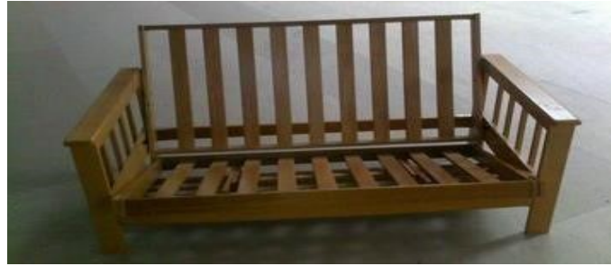
Picture 3.7: Seating and back furniture frames proper with general frame

If hardwood is done on the prepared frames or upholstered cushions , the lamp is sticked with plywood in accordance to number of measurement and length by increasing these materials If soft upholstery is done , the process of upholstery is done by hammering rubber and cotton colons on the colon.