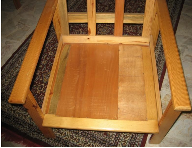
Picture 3.9: Seating and back of furniture frames with cushion upholstery