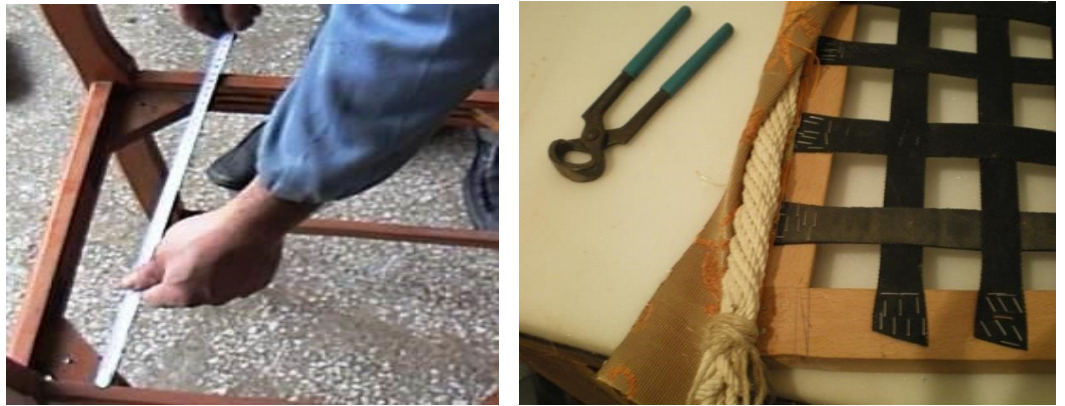
Picture 3.5: Measuring furniture frame and Furniture frame hammered rubbered colon

The place of sitting and osculation of sofa or chair which is made furniture frame is measured. The spaces made up massive tree is cut , measured and sticked in accordance to stage of angle combination . If the frame is not covered , the combination can not ve mortising which is combined so that mortising is invisible .